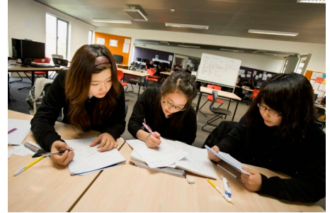
In a group