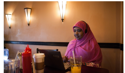
In a busy place