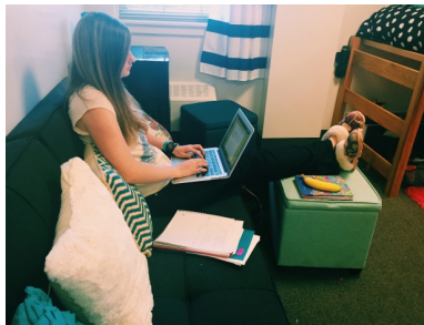
In a quiet place